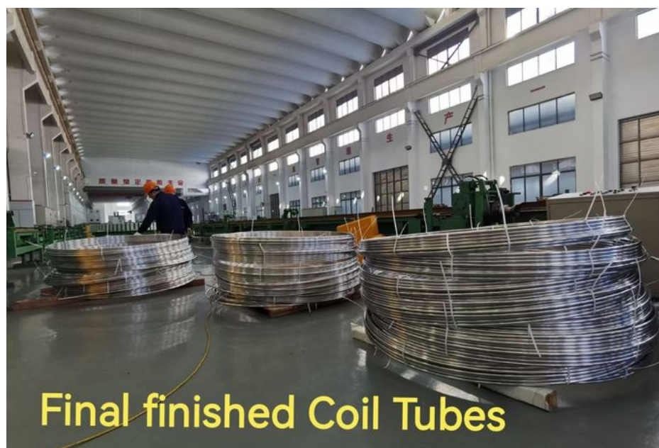
Final finished Coil Tubes