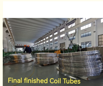
Final finished Coil Tubes