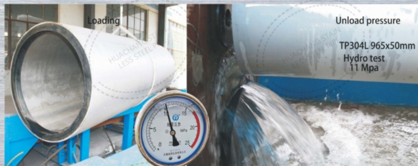
▲ Hydrostatic Test