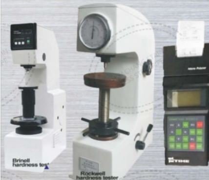
▲ Hardness Tester