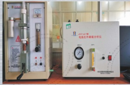
▲ Infrared sulfur carbon analyzer