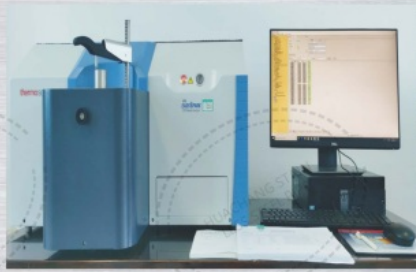
▲ Direct reading Spectrometer