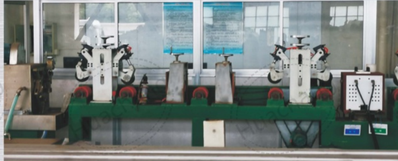
▲ Eddy Current Tester