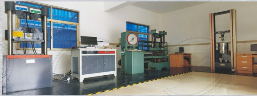
▲ Universal Testers & Hot Tensile Tester