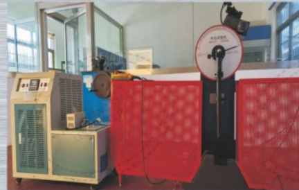
▲ Impact Tester