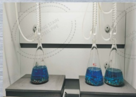
▲ IGC ( Intergranular Corrosion Test)