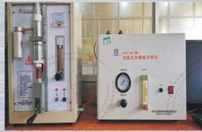
▲ Infrared sulfur carbon analyzer